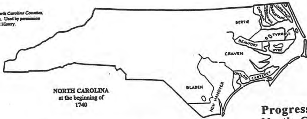
NORTH CAROLINA at the beginning of 1740