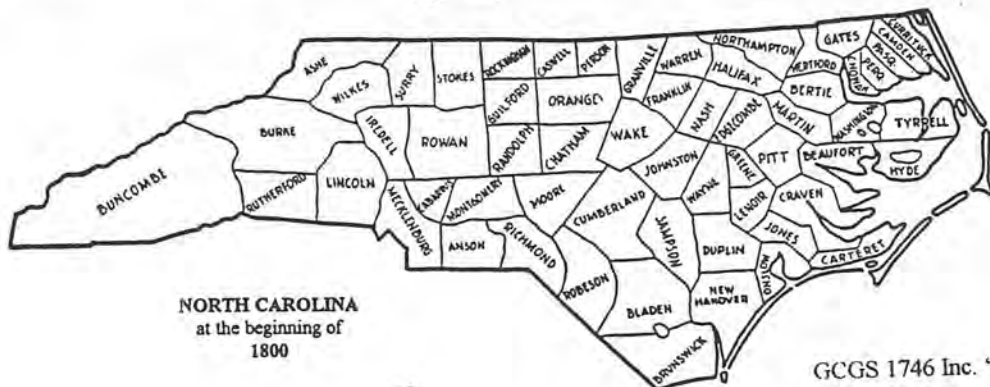
NORTH CAROLINA at the beginning of 1800