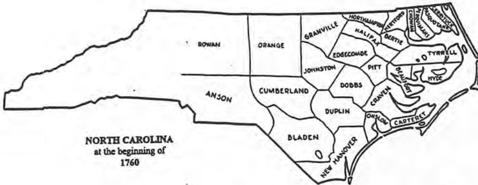
NORTH CAROLINA at the beginning of 1760