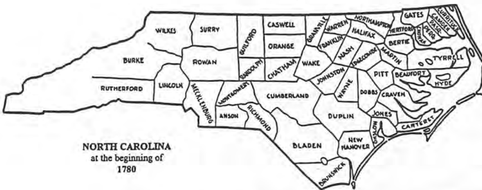
NORTH CAROLINA at the beginning of 1780