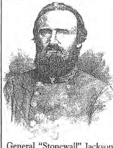
General "Stonewall" Jackson

One Connecticut soldier claimed that his company had eaten so much mule meat that the ears of every man had grown 3 1/2 inches. 39