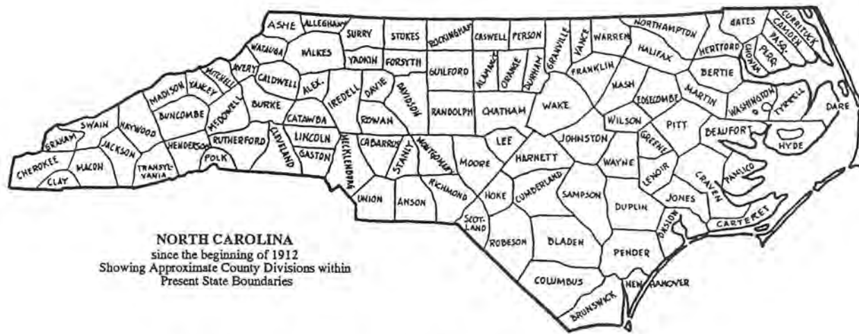
NORTH CAROLINA since the beginning of 1912 Showing Approximate County Divisions within Present State Boundaries