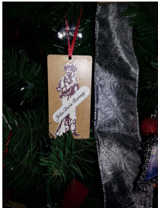
Confederate Tree Ornament