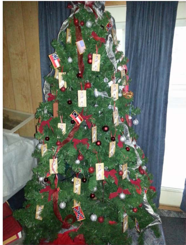
Confederate Christmas Tree