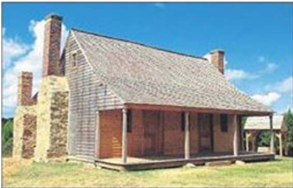
Barker House after restoration

Family reunions have already started. I attended the Barker reunion in May and what a celebration it was. The house our ancestors lived in has been completely restored and also put on the Historical Register. This is a picture and write-up that was in the Daily Dispatch. My great, great grandmother was raised in this house.