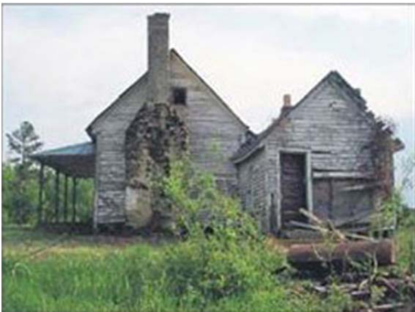
Barker House constructed around 1763