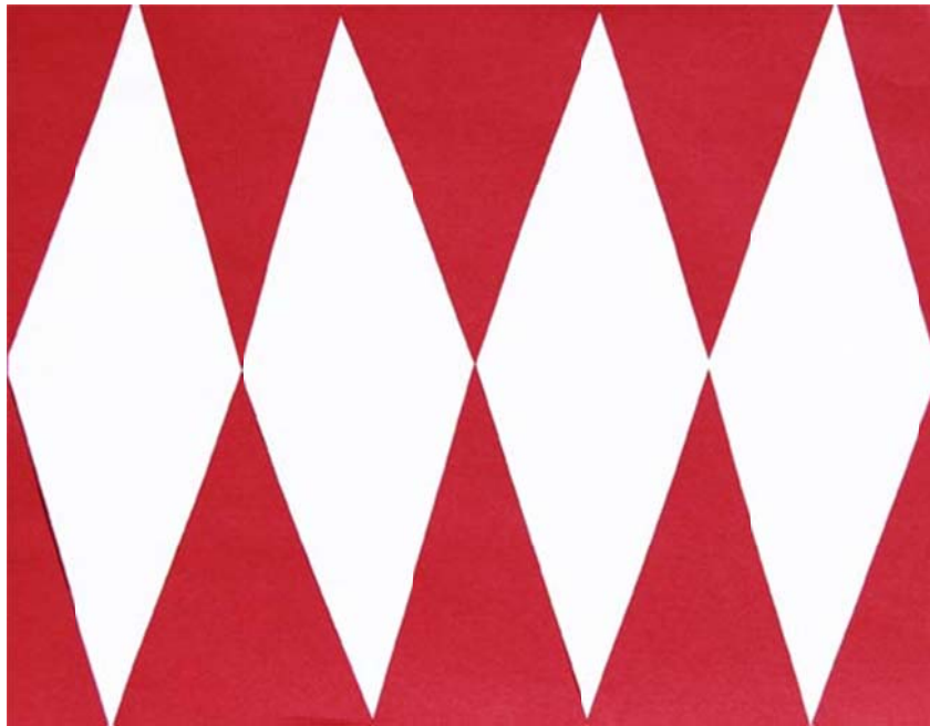
Granville County Flag (red & white)